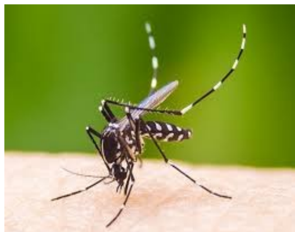
Fig no: 01 Aedes aegypti mosquito

Dengue haemorrhagic fever was first recognised in the 1950s during dengue spreads widely in the Philippines and Thailand. Today it affects Asian and Latin Americans and has become a leading cause of hospitalization and death among children and adults in these regions 4 . The full life cycle of dengue fever virus involves the role of mosquito as transmitter and humans as the main victims and source of infection. The aedes aegypti mosquito is the main vector that transmits the virus that causes dengue, the virus are passed onto humans through bites of inactive female aedes mosquito, which mainly acquired the virus while feeding on the blood of an infected person.