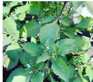
Fig: 1 leaf of s.nigrum

with hairy leaves and stems. The leaves vary in size and shape, and can be whole or split. They are generally alternate, dissected, and without stipules. The morphological analysis reveals the root externally, it is smooth and pale brown, with a few branches and many little lateral roots. The fruit has a thin, papery epicarp, a pulpy mesocarp, and axile placentation; the seeds are free in the pulp. is a type of fruit. Berries with a size of 6 micrometres and an obtuse shape are typical [12].