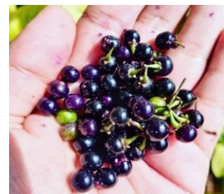
Fig: 2 fruit of s.nigrum