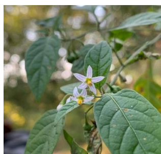
Fig: 3 flower of s.nigrum